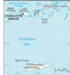
US Virgin Islands