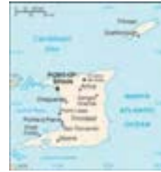
Trinidad & Tobago