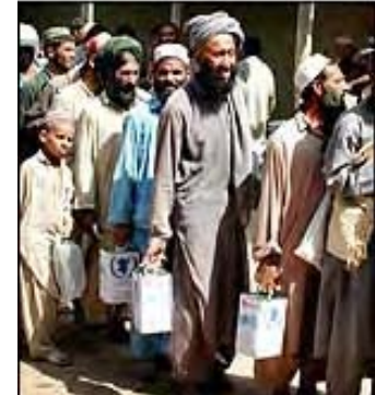
Refugees & Displaced